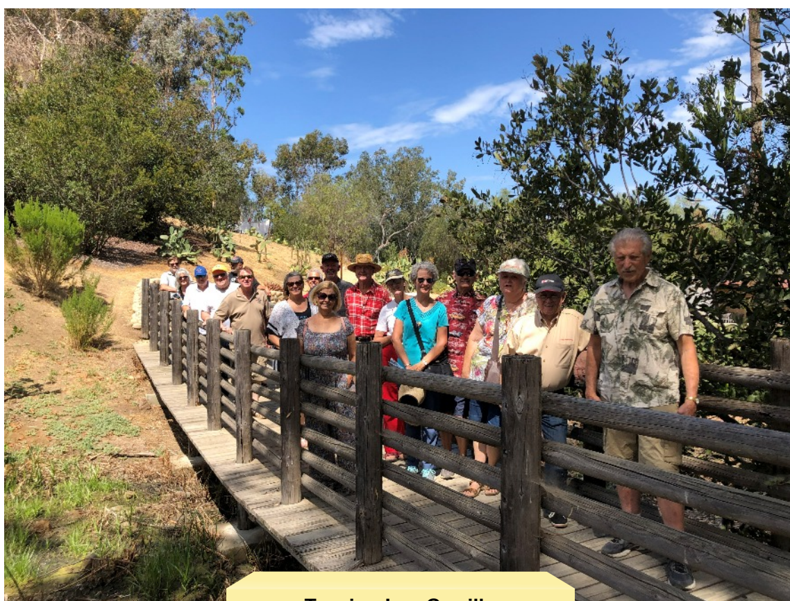
Touring Leo Carrillo Ranch Historic Park