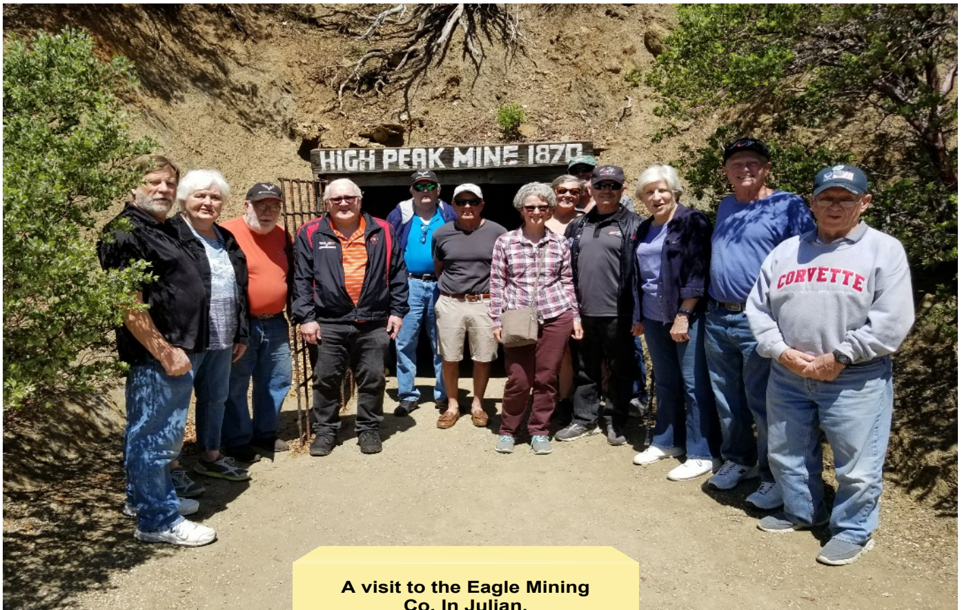
A visit to the Eagle Mining Co. In Julian.

What's Inside: Board of Directors Club Events Calendar About Our Club