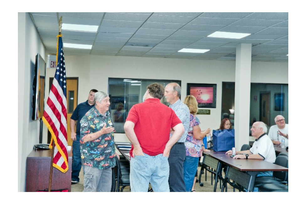
Snapshots of a Meeting