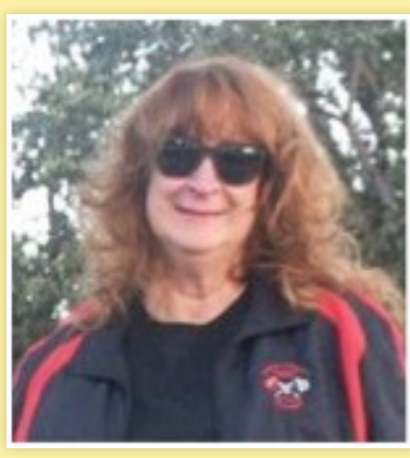
Hard to believe Fall is here......