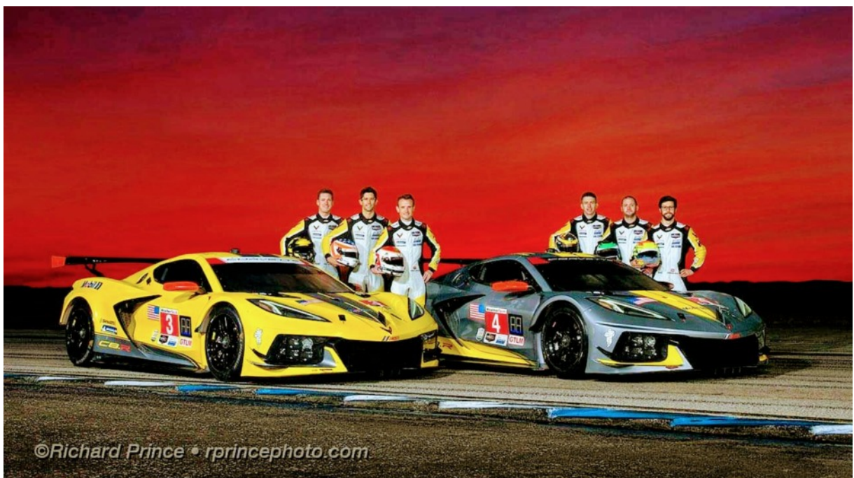
Corvette Racing Teams