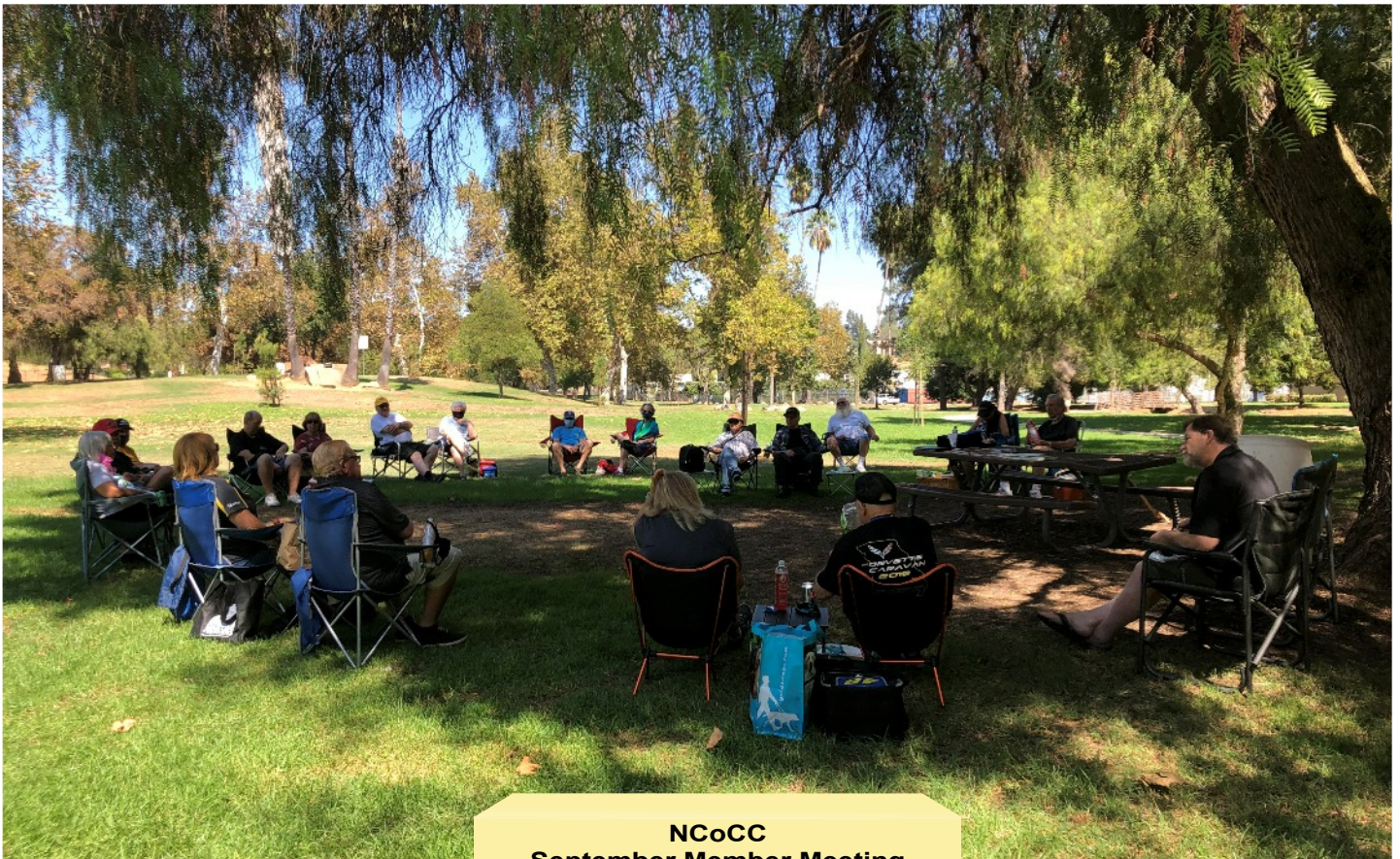
NCoCC September Member Meeting Pandemic Style